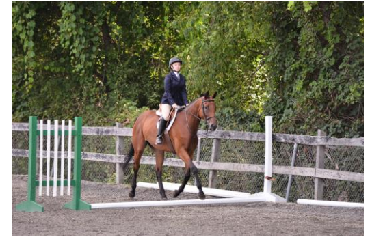
Mommy's Dearest "Ginger"